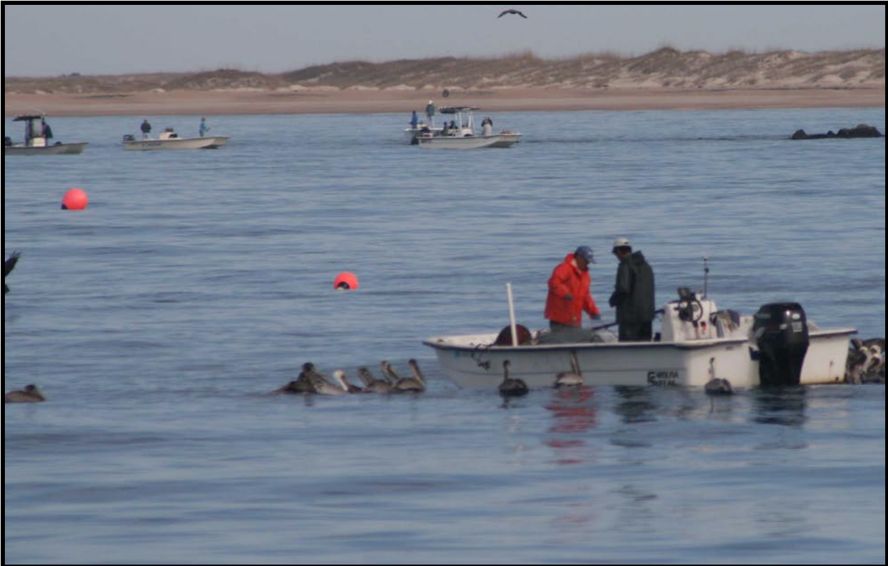
Below: Four photos of fishing boats (some gillnets, some hook and line) near the rock jetty off the western beach of Cape Lookout: