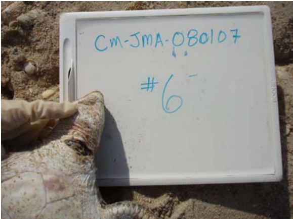
CM-JMA-080107-07 entanglement marks to right flippers: